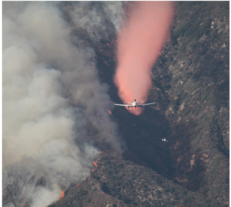
August 29th: a DC-10 drops retardant just north of JPL.

Right: At the Santa Clara River estuary, an unusual Heerman's Gull shows jaeger-like white primary covers.