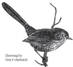
Drawing by Guy Coheleach