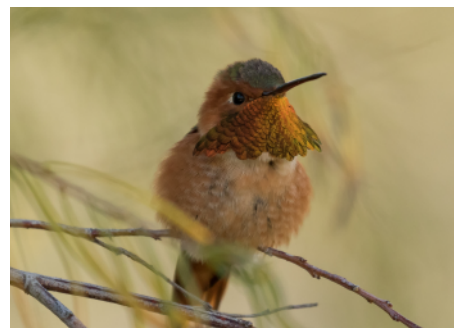
Allen's Hummingbird

Save the date! The June dinner is always a fun event. We serve delicious catered food with beer, wine, and other beverages. An entertaining program will be featured. Watch for the June issue of The Wrentit, arriving in mailboxes around June 1, to get full details on pricing and how to reserve your seat.