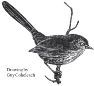
Drawing by Guy Coheleach