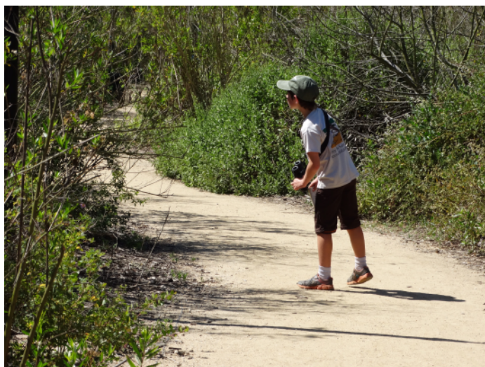
Calvin Bonn