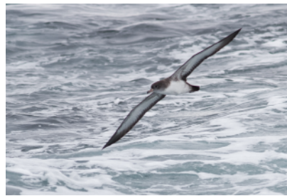
Pink-footed Shearwater