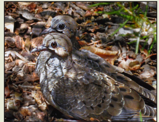
Juvenile Mourning Doves

Once the males of our species have succeeded in finding females interested in being their mates, the males then show their hens potential places to begin building their nest together, usually in shrubs or trees with dense foliage to provide coverage. The females get the final say, of course, and once we find a spot we like, our mates then bring us twigs for us to weave into a beautiful nest. Other birds may say that Mourning Dove nests appear “flimsy” or “haphazard” or “evidence mother nature likes Mourning Doves in particular because by all logic they should have gone extinct by now – their nest building skills are that terrible,” but we like our nests just the way they are, thank you very much! They hold our two perfect white eggs, and the helpless pink squabs that emerge from them fourteen days later are ready to earn their spots and confuse the neighbors once more with their hopeful coos!