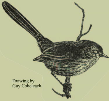
Drawing by Guy Coheleach