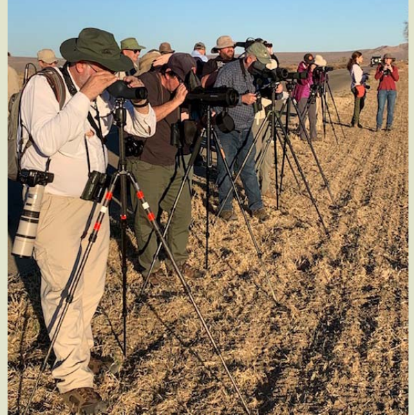
Looking at Mountain Plover