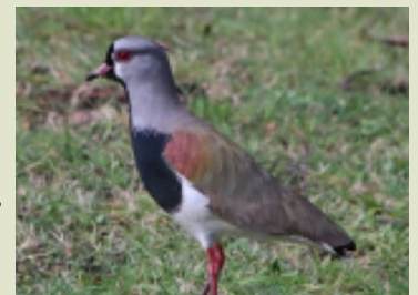
A Southern Lapwing in a (thankfully) peaceful moment

Last but not loudest, Southern Lapwings are large plovers that dwell in wetland habitats and open flat fields, where they dine on small fish, worms and insects. Known in Chile as the Queltehue or Tero, these are pretty birds, with wings of iridescent green turning russet at the shoulders, blazing red eyes, a black wispy crest and a black stripe running down their face, widening to cover the breast. Males have pink wing spurs, which they use in battles for mates. The vocalizations of Southern Lapwings have been variously described as "grating", "yappy", "shrill", "cackling", "raucous", "harsh" and "penetrating". They squawk at passing humans, dogs or anything else they feel threatened by. They are some of the best watchdogs or "watchbirds" we have ever encountered, possibly because they nest out in the open on the ground. They are on duty full-time, and sometimes make their alarming calls deep into the night, depriving us of sleep. We enjoy having them around anyway.