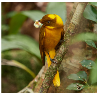
The Golden Bowerbird is one of 53 species with the dubious distinction of being featured on "Songs of Disappearance".