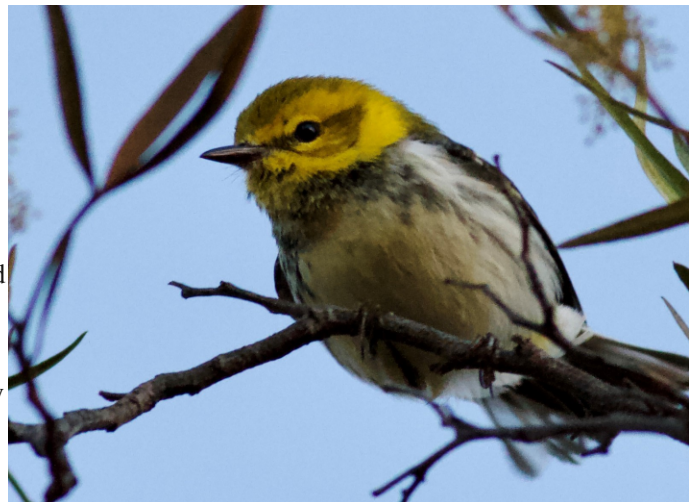
Rarely seen in our count circle, this Black-throated Green Warbler was nice enough to show up at Huntington Gardens on CBC day.

We began developing a Strategic Plan in the fall of 2019, and we sought help from Jericho Road, a local non-profit that supports other non-profits. They sent us a wonderful facilitator, and he helped our Strategic Planning Committee through the