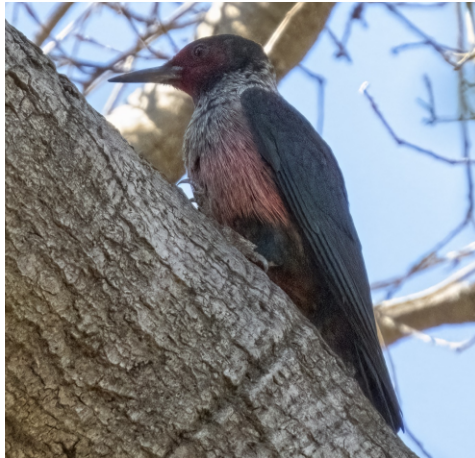
One of the five Lewis's Woodpeckers seen on count day.

A Long-eared Owl at Hahamongna Watershed Park was a really nice find and just the fourth record for the count. This species is almost certainly more common in winter on the coastal slope than records would indicate. Much more expected were a single Barn Owl and one Western Screech-Owl.