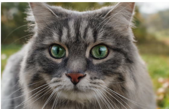
A beautiful animal in its own right, to be sure, but this domestic cat doesn't give a rip about bird conservation, and that's a serious problem.

What about the trade-off in terms of the quantity of songbird lives these pets prey upon? The conservative estimate from a 2013 study (Loss et al.) is 221 million birds killed by outdoor domestic cats annually, while the point estimate is closer to 700 million. The numbers are jaw-dropping because there's nothing natural about unleashing feline predators who, unlike the bobcat, didn't evolve with North American avifauna. Our birds are not adapted to deal with the threat these outdoor cats pose. But even if you think the lower bound estimate is too high by a factor of ten, you'd still have to admit that's an awful lot of easily preventable songbird deaths. So along with the snap traps, sticky traps, and rodenticides, let's keep the cats indoors.