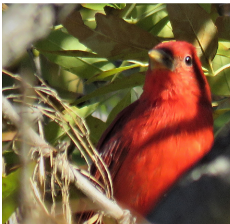
This male Summer Tanager, the only one seen on count day, trying to be discrete but sticking out like a sore thumb in his bright red plumage.