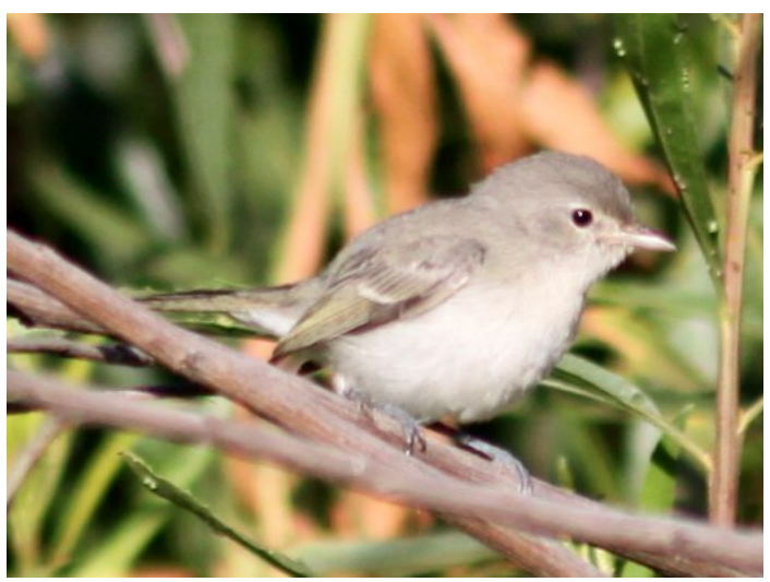
Looks better in color! Check out www.pasadenaaudubon.org