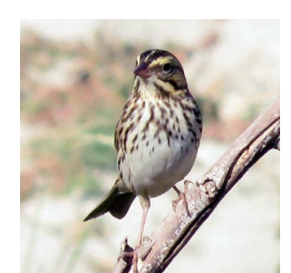
Savannah Sparrow

This class is designed for beginners, but all are welcome. We will cover the basics of identification (sight, sound, behavior), optics, field guides, habitats, birding ethics and many other topics. Our goals are to help class participants become familiar with local birds and to be comfortable on birding field trips. Class size is