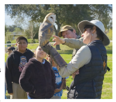
Fifth graders enjoy a close encounter with Honey the Barn Owl

There were a lot of "firsts" involved: one first-grade class, a first birding excursion for many young folks and the first time Pasadena Audubon has brought a class to Peck Park as a part of the new Bird Science Program. The Bird Science Program is a two-part program, with the first being two in-class lessons involving birds in alignment curriculum standards appropriate for the grade level. The second part takes place the following week with an outdoor adventure exploring nature, viewing educational birds brought by Wild Wing and learning how to bird at Peck Park.