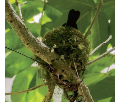
Tahitian Monarch on nest

up the hillside, criss-crossing the small stream multiple times, and then a light tropical rain began to fall just as we found an occupied nest. What a delightful sight given the fact that there are less than 100 of these birds alive.