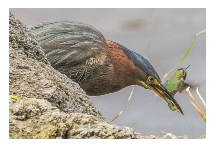
Figure 1: Green Heron capturing Anna's Hummingbird, which later escaped, Los Angeles County Arboretum, Arcadia, February 5, 2017.

According to the authors, there are few records of a Butorides heron feeding on birds; the event at the Los Angeles County Arboretum is only the second case involving the Green Heron or involving hummingbird prey. It is not clear, the authors add, whether the heron was actively hunting the hummers or was reacting to their apparent harassing behavior.