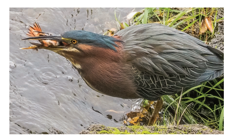
Figure 2: Same Green Heron capturing, consuming Allen's Hummingbird, Los Angeles County Arboretum, Arcadia, February 5, 2017.