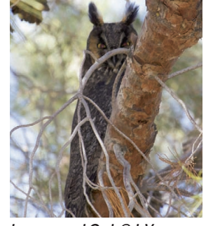
Long-eared Owl © J. Vazquez