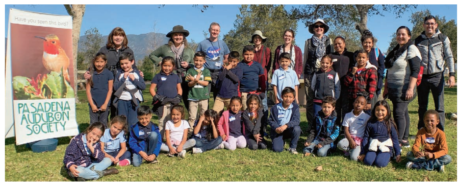
Happy first graders along with parents, teacher and PAS volunteers at Peck Park