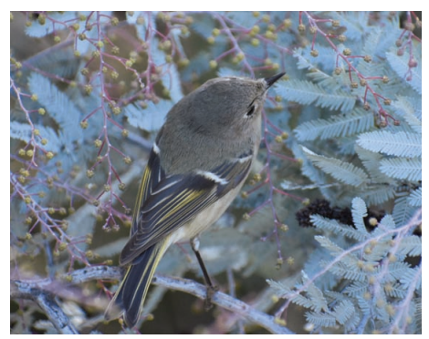
Ruby-crowned Kinglet © Adriana Kleiman

http://www.pasadenaaudubon.org/?q=youngbirders