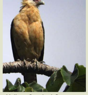
Yellow Crested Caracara

the day, each male calling out his territory. We caught a view of one off the veranda one morning, its black wattles hanging from its chin. They seemed to throw their voices like ventriloquists throughout the mid and upper story of the forest.