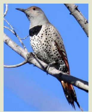
Northern Flicker