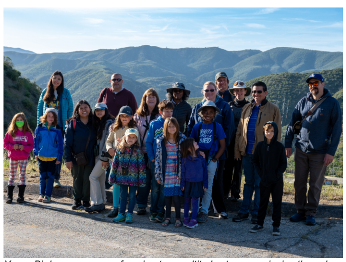
Young Birders were eager for migratory multitudes to come zipping through the divide.

Last month PAS hosted a field trip at Bear Divide and thankfully, it was a more typically exciting day of migratory action. Highlights included Lazuli Bunting, Black-headed Grosbeak, and, as promised in the April Wrentit , a Hermit Warbler, albeit just the one. The real show-shopper was the Broad-winged Hawk, a raptor seldom seen on the West Coast and never before recorded at Bear Divide.