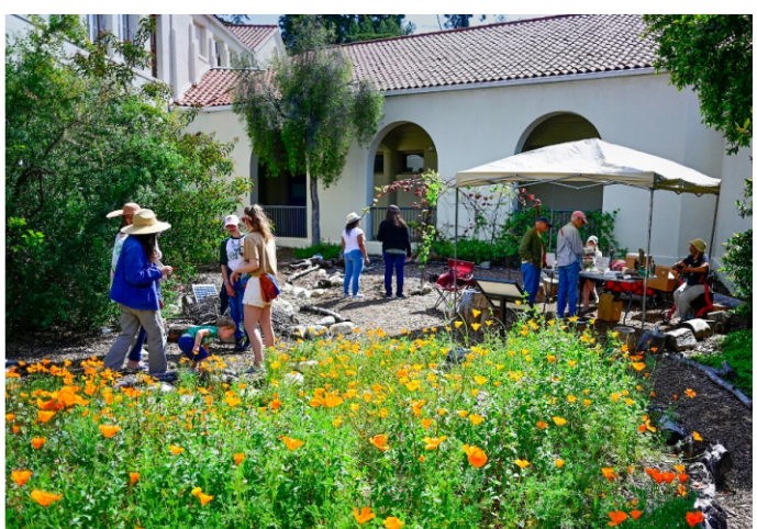
Evellyn Rosas and PAS Volunteers have the Washington Elementary Garden looking so sweet it was featured in Theodore Payne's Native Plant Garden Tour back in April.

teachers and students adopt the space as we had hoped, as a learning resource to connect with the natural world.