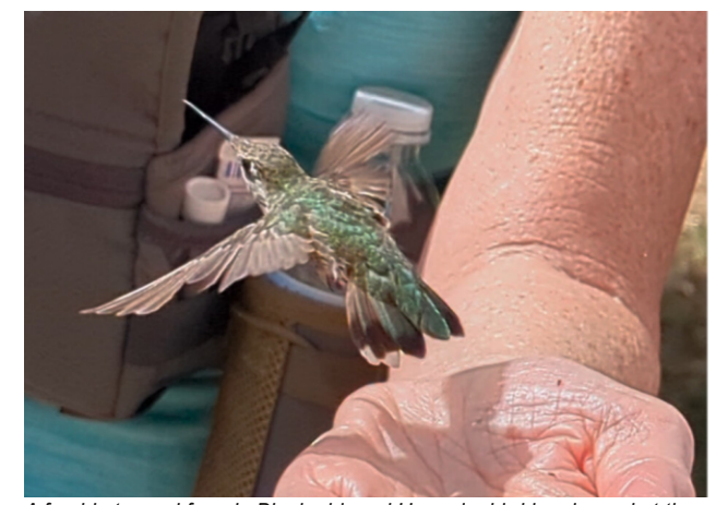
A freshly-tagged female Black-chinned Hummingbird is released at the home of Rich Armstrong during the 9th Sedona Hummingbird Festival.

Even with the relentless 100-plus degree weather, the trip was charm -ed, to use the collective noun for a group of hummers. I saw the Rivoli's (formerly called Magnificent but still magnificent), heard a lecture about an endangered species on a remote Pacific island, held a Black-chinned in my palm, and bought way too much merch