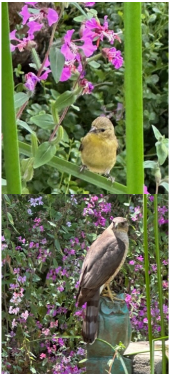
An Orange-crowned Warbler (top) and a Cooper's Hawk (bottom) perch amid the mixed-color Clarkia blooms.

Wrentit: I want to promote native gardens for all the reasons you've mentioned, but have there been any unforeseen challenges with maintaining one?