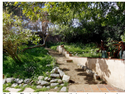
Before: The backyard was mostly invasive weeds and grasses, with Oleander lining the privacy hedge. A stucco wall lined the garden path.

about gardening. Our instructor, the amazing Yvonne Savio, set up field trips for our class. One of them was to a garden which was planted with a majority of natives, the yard smelled and sounded differently than anything I had ever