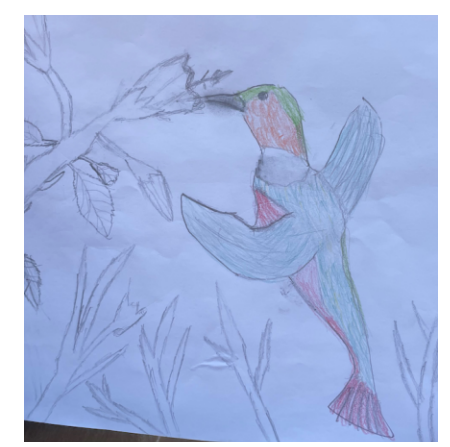
The work of a camper who "drew" inspiration from Allen's Hummingbird, as so many of us have.

When the kids pick up markers and scissors and craft something bird- related, I know they are exercising their expressive skills and their own curiosity and wonder