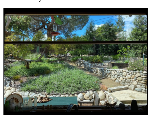
After: Looking out the back window, Bee's Bliss and Pigeon Point carpet the ground by the Pomegranate Tree, opposite an arroyo rock wall. The Oleander was replaced with Catalina Ironwoods and Tecate Cypress.

I have always been a nature lover. When I was a kid I was not a