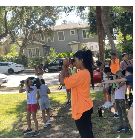
Campers and counselors birdwatch at a PAS summer outreach event.

Another of my favorite parts of our program is teaching the kids how to use binoculars. When a kid who has assured us that s/he has 'got it', there are no black moons, you say ok, and five minutes or half an hour later you hear a cry of "I see it!" They have made this heavy piece of professional equipment