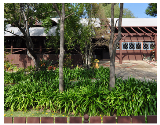
planting things Before: Agapanthus, native to Southern Africa, that I liked dominated the front yard ground cover of Pilar and and had no idea what I

Pilar: When I purchased my first home, I did what everyone does, I started planting things that I liked and had no idea what I was doing.