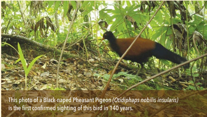
This photo of a Black-naped Pheasant Pigeon ( Otidiphaps nobilis insularis ) is the first confirmed sighting of this bird in 140 years.