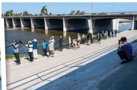
Birders line the concrete banks of the L.A. River.