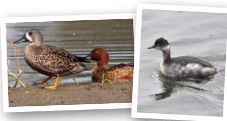
Have you seen these birds? Blue-winged Teal and Eared Grebe were missing from our CBC 2023.