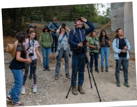
Scanning the skies at Arroyo Seco.