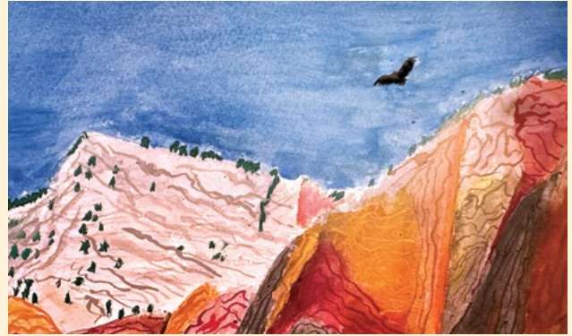
California Condor watercolor.

I am very thankful for the Young Birders Club and for the knowledge it has given me. I have learned so much about birds in the year that I have been a member, and I look forward to learning more in the future.