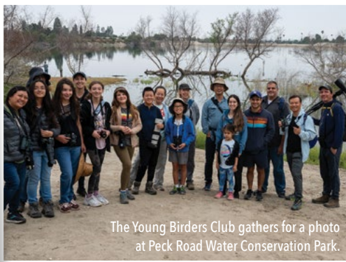
The Young Birders Club gathers for a photo at Peck Road Water Conservation Park.