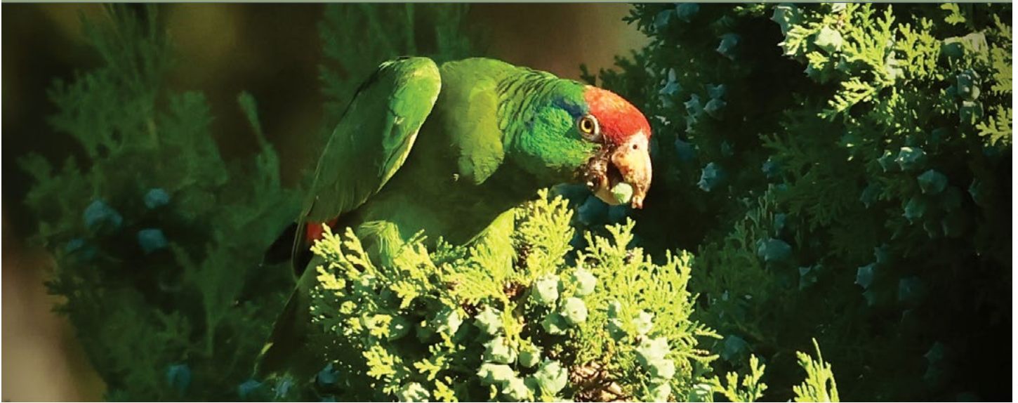
Red-crowned Parrot in La Cañada Flintridge, July 2024

PASADENA AUDUBON SOCIETY, FOUNDED 1904 | VOLUME 73 · NO. 2 | NOVEMBER 2024-JANUARY 2025