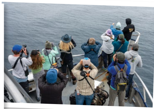
A gaggle of birders at the boat's bow scan the sea for birds.